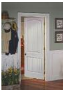
Cheyenne Interior Door 2 panel smooth. Beaded plank design. 30" X 80". (CHEYENNE)