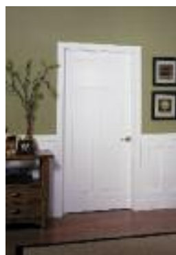
Glenview Interior Door 3 panel craftsman smooth. Shaker panel profile. 30" X 80". (GLENVIEW)