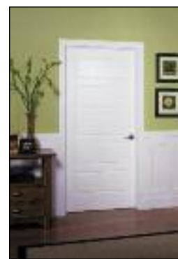
Riverside Interior Door 5 panel smooth finish. 30" X 80". (2480RIVER)

Special Order Doors YOUR CHOICE 69 95 Each